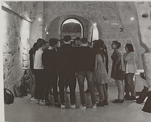
Studierende in den Höhlen von Matera

Entstanden als ein internationales Kooperationsprojekt zwischen der Universität Basilicata, dem Onyx Jazz Club Matera und der Leibniz Universität Hannover, experimentiert „Matera Soundscapes“ im Rahmen des Jahres von Matera als europäischer Kulturhauptstadt 2019 mit dem Thema von Sound als neuer Methode und Werkzeug für den Städtebau. Das Design-Forschungsprojekt knüpft an die wissenschaftliche Arbeit zu „Dynamics of Periphery“ 1 an und untersucht neue Formen von Narrativen zur Vermittlung von urbanen Zukunftsvisionen mit Bezug auf den kulturellen, sozialen und räumlichen Kontext. Die zum Workshop entstandene Publikation zeigt interpretative und kompositorische Elemente, die als Basis für eine Soundinstallation in den Sassi in Matera dienen.