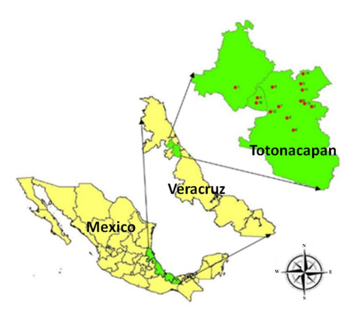
Figure 3. Study area of Veracruz, Mexico.

The study area belongs to the municipality of Papantla, known as Papanteca, with coordinates 20°27'39" S and 97°19'39", W, and it lies at 180 m above sea level. It has an area of 1458.50 km<sup>2</sup>, which represents 2.03% of the state.