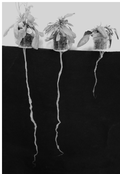
Fig. 14.1. Arabidopsis thaliana Columbia ecotype control plants (left), inoculated with CMV (centre) and treated with Cd (right) about 12 days after the viral infection of exposure to heavy metal.

Recently, Vitti and co-workers (2013) demonstrated that changes in root morphology observed in A. thaliana seedlings subjected to both biotic (CMV) and abiotic (excess cadmium) stressors are probably due to modifications in hormonal balances. As shown in Fig. 14.1, in our experience, evident variations