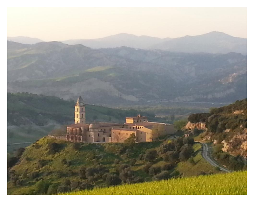
Fig. 2: Historic rural landscape located in the "Agri Valley" in the Basilicata Region.

The buildings identified along the way have a strong historical value. In fact, it was possible to notice the presence of buildings of special architectural and landscape value (Fig. 2).