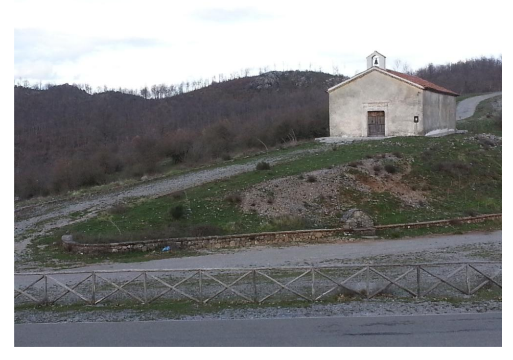
Fig. 3: Rural religious building, located in the Agri Valley, in the Basilicata Region.

In all cases, the observed structures are made of poor materials, locally available, such as stones, clays and wood.