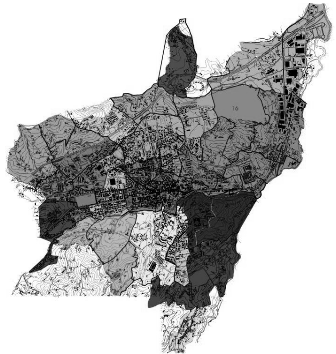
Fig. 3 Mapping of homogeneous zones

These units form the prototypes (training set) on which train the neural network. The multi-layer perception network used in the application is defined by a single layer of neurons and by a non-linear transfer function (sigmoid). The processing performed on the matrix of the profiles and with the selection of a target nominal (symbol) for the training set, assigns to the margin areas of the class to which they belong. The graphical representation of the output of the network (some units of the training set undergo a correction of the target) is shown in Fig. 3. Each homogeneous zone - represented by a different color - is identified by spatially contiguous areas of the same class and therefore defines areas of urban land within which there is homogeneity of physical and economic factors