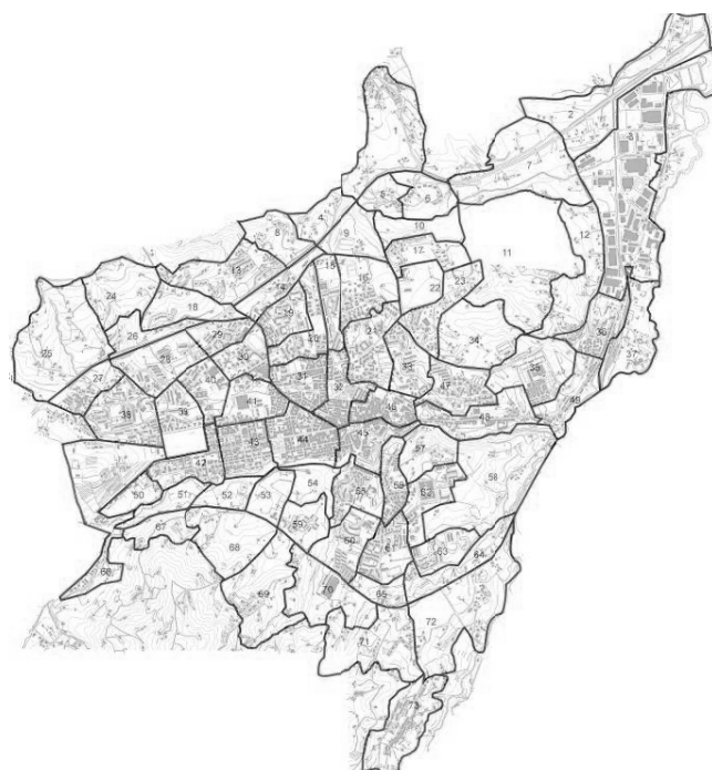
Fig. 1 Subdivision of urban places into attitudinal areas

The territorial division (phase 1) carried out a mapping scale 1/2000 and on the basis of arguments put forward by reading the information on the same map, as well as on that of the urban zoning, produced ( n ) 73 attitudinal areas. The graphical representation is in Fig. 1