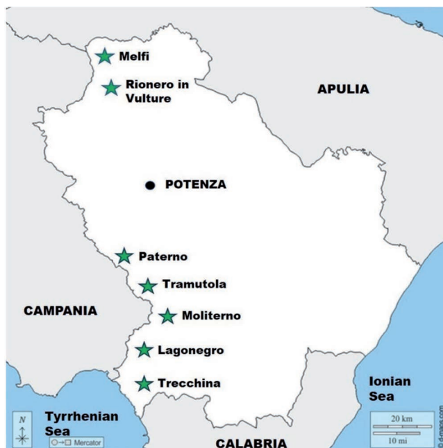
Figure 1. Basilicata region map (taken and modified from https://d-maps.com/carte.php?num_car=7976&lang=en ) showing the sampling sites for C. parasitica . Green stars mark the sampling localities.

Plugs of cortical and woody tissue pieces (2×2 cm) were taken from each sample from the margins of the symptomatic parts. Under sterile conditions they were superficially disinfected, cut in small pieces and placed in Petri dishes containing Potato-Dextrose-Agar (PDA) media Oxoid™ (Thermo Fisher Scientific Inc., Waltham, MA, USA) amended with kanamycin (50 µg/mL) following a protocol fully described by Mang et al. 16,17 Inoculated plates were incubated at 25°C in the dark and kept under observation until the appearance of the mycelium. All developed C. parasitica colonies were individually transferred to new Petri dishes containing the same media to obtain Pure Fungal Cultures (PFCs). After 10 days, the PFCs were divided based on morphological features in virulent, characterized by a red-orange color aspect and by numerous pycnidia, and hypovirulent, which showed a whitish mycelium and an absence or a limited number of pycnidia.