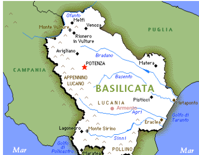
Fig. 1 - Mappa della Regione Basilicata con l'indicazione dei quattro fiumi che la attraversano, dei due capoluoghi di regione, Potenza e Matera, e del Comune di Armento