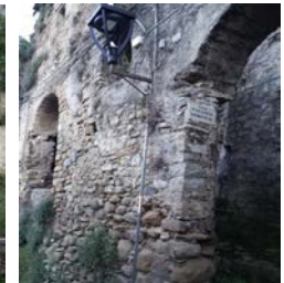
Fig. 8 - Palazzo Terenzio dimora del senatore Terenzio Lucano (II a.C.) secondo la tradizione verbale locale