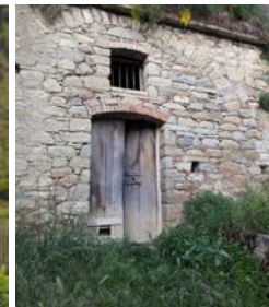
Fig. 7 - Tipologia costruttiva con arco ribassato in pietra di fiume e tetto in legno a doppia falda