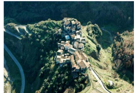
Fig. 2 - Sviluppo dell'abitato lungo il crinale roccioso da cui si domina la valle della Fiumara di Armento