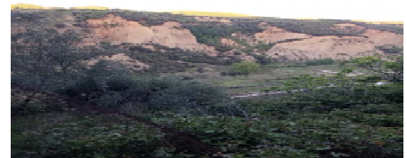
Fig. 3 - Vista dal Casale della Valle della Fiumara di Armento