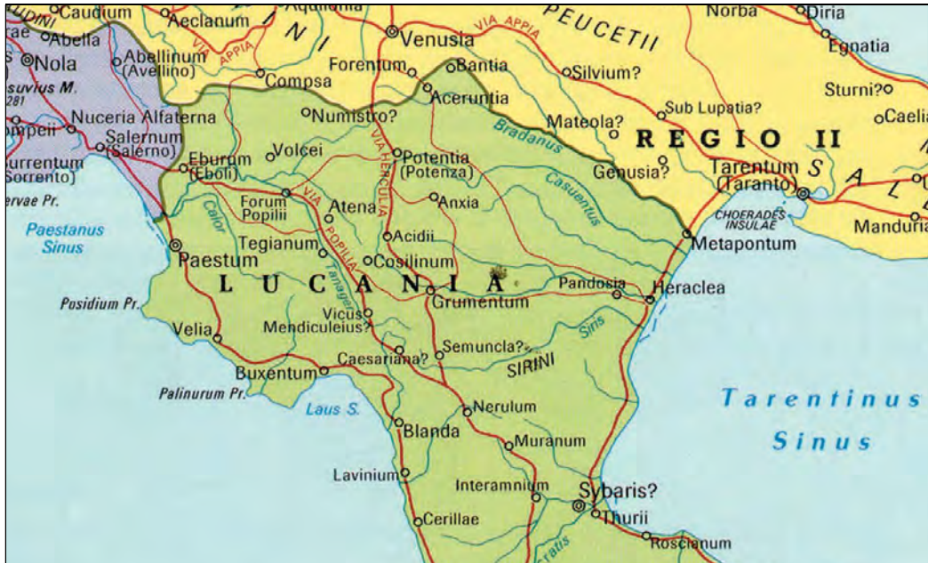
Fig. 1: The Herculia Way in Southern Italy, in the "Descriptio Augustea"