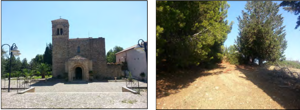
Fig. 3: Rural religious building in Anglona and a minor road thereby.

The field survey that was conducted has allowed the identification of the main elements of the rural landscape, generally different in type and use, like rural buildings and sheep tracks. In particular, it emerged the presence of several distinguished rural constructions, both buildings and minor roads, characterized by a significant architectural, environmental and historical value (Fig. 3).