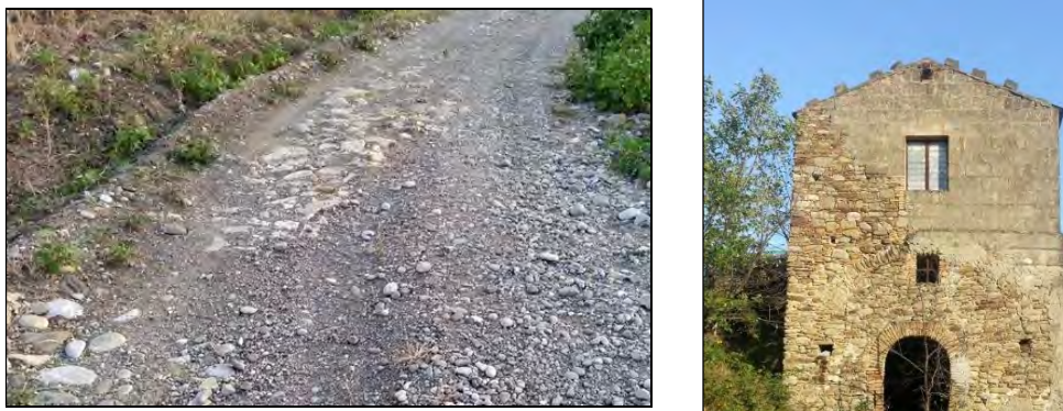
Fig. 4: Particular of sheep track in original flooring built in local stone and constructions of small size.

Concerning the three analyzed road paths, constructions of small and medium-size (Fig. 4) have been observed; currently they suffer of low maintenance, or they are completely abandoned. However, in some limited cases, medium and large buildings were well preserved.