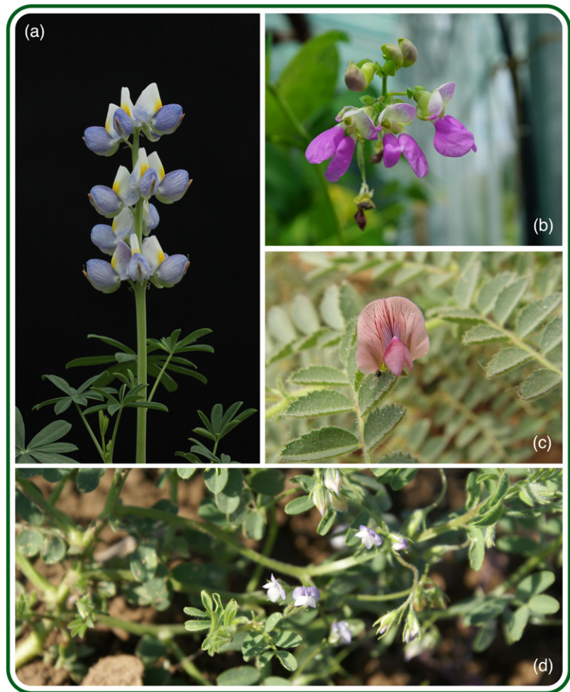
Figure 1. Flowers of the four INCREASE legume species. (a) Lupin ( Lupinus mutabilis Sweet). (b) Common bean ( Phaseolus vulgaris L.). (c) Chickpea ( Cicer arietinum L.). (d) Lentil ( Lens culinaris Medik.).

heterogeneous, which impedes the projection of the phenotypic information to the genotype and vice versa ; moreover, if available, single-nucleotide polymorphism data are mapped to a single reference genome, which exclude variants present only in a subset of accessions, without the possibility to access structural variations and to obtain a complete picture of the functional genetic variation (Richard et al., 2021);