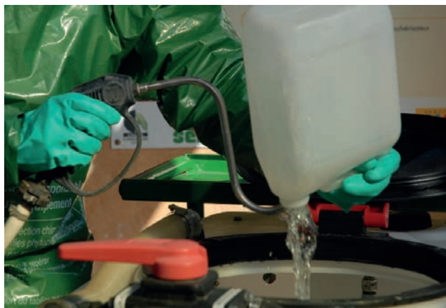
Figure 3. Triple-rinsing at the AgroChePack pilot station in Cellamare (BA, Italy).

According to the composition of the pesticide, the concentration thresholds for its hazardousness were evaluated on the basis of the Regulation n. 1272/2008 (European Parliament, 2008). The acute (short-term) toxicity in aquatic environment was evaluated for both mixtures of the not aged and of the aged APPW. The mixture contained in the not aged APPW had a LC 50 value of 9.83 mg/L and that in the aged APPW had a LC 50 value of 10.04 mg/L. According to the limits identified in the Regulation, no classification for acute toxicity was needed.