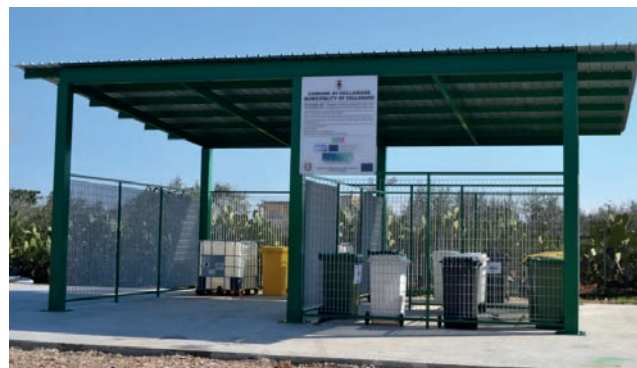
Figure 1. The AgroChePack pilot station at Cellamare (BA, Italy).

Two identical PE/PA pesticide bottles with a 0.75 L volume were subject to decontamination according to the triple-rinsing procedure (Figure 2) described in the Guidelines for small containers outlined as a result of the AgroChePack Project. The bottles